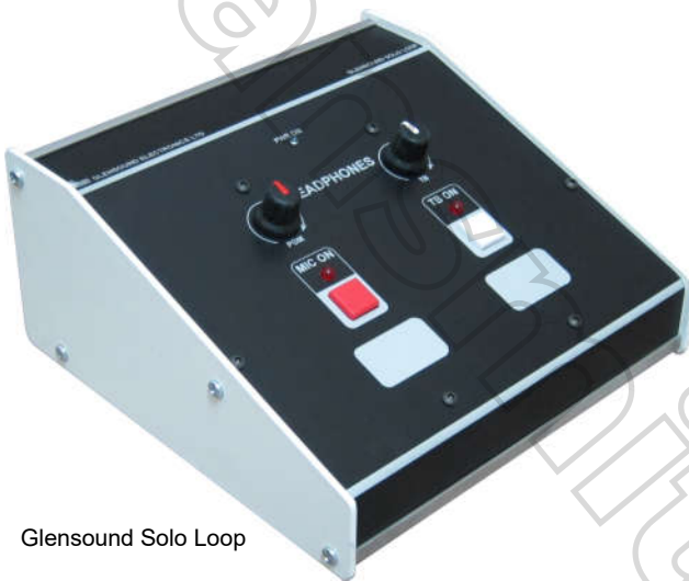
GlenSound Solo Loop